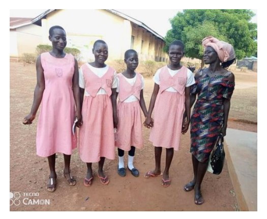
A little group of blind children happy to be back in school.

One of our girls recently completed a certificate course in business management. Imagine our pride when she received her certificate and a special award for outstanding performance!