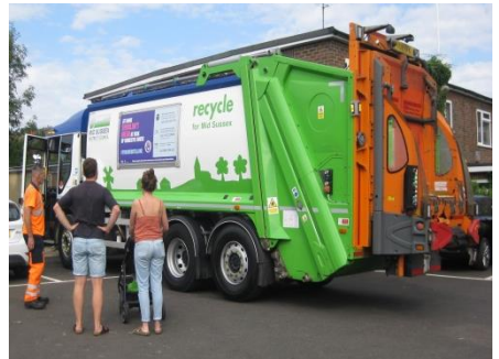
Waste Freight driver answering questions

"Like aluminium cans, aluminium foil is 100% recyclable, and a valuable recyclable material as it doesn't lose any quality during the recycling process. The more food waste you can scrape off used foil, the better. Small amounts will be okay. Cut out larger amounts and put the really damaged foil into your black bin. Scrunch all your clean foil, both big bits and small, into a ball until it is at least the size of a tennis ball and put it in your blue bin."