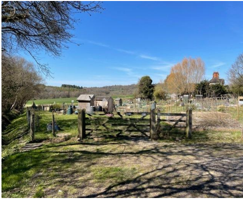
Open day at the Ardingly Allotments