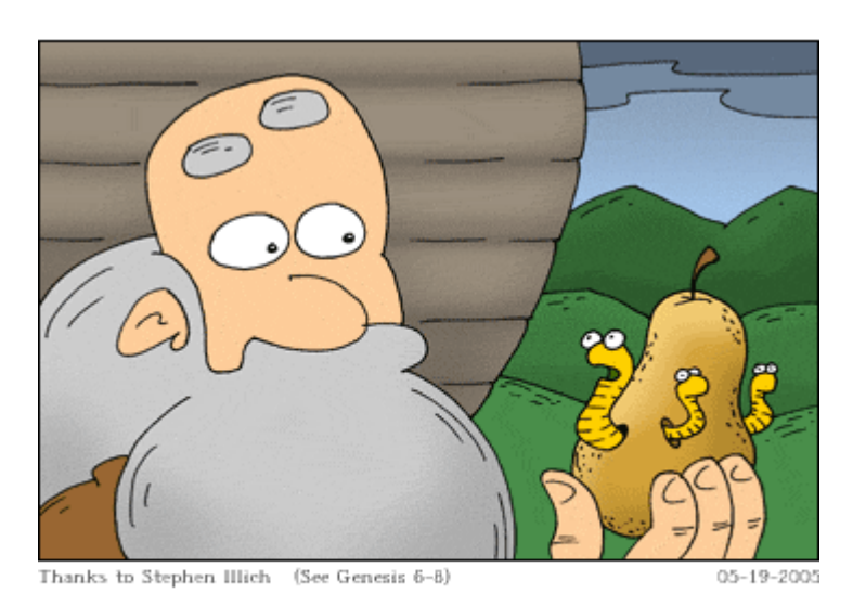
WE WERE TOLD YOU WERE TAKING CREATURES THAT CAME TO YOU IN PEARS