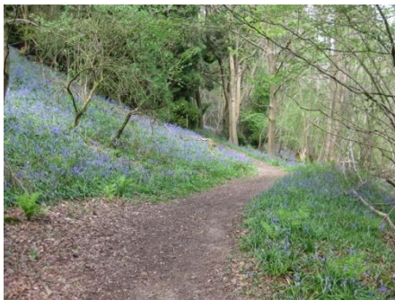
Bluebells in Cob Lane

What a pretty place Ardingly is! Especially at this time of year. The garden flowers, wild flowers, Magnolia, Forsythia, Cherry Blossom followed by Blackthorn all along the hedgerows, have been a treat for the eyes! Who would want to live anywhere else?!