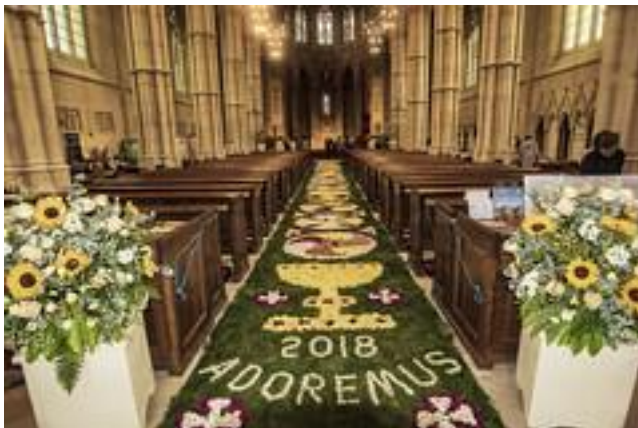
The 2018 carpet of flowers

Anyone who loves a good Flower Festival may like to visit Arundel Cathedral between 9.30am and 8pm on Thursday 20 th June to see the Corpus Christi Carpet of Flowers. A huge amount of work always goes into it, and the results are impressive. Admission is free and parking is available a short walk away in the castle grounds.